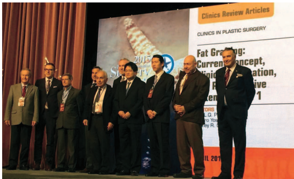
Fig. 2. All 3 editors and most of contributors for these 2 issues of Clinics in Plastic Surgery were acknowledged during the opening ceremony.

On the third day of the congress, 3 concurrent sessions were held. In Room A, panel presentations were continued. In the body contouring and extremity panel, correction of liposuction created contour deformity with fat grafting, a 30-year experience of liposculpture, and ultrasonic assisted megalipoplasty were presented. In 2 regenerative application panels, scaffolds in regenerative surgery, lift and fill facelift, tissue-engineered dermis grafting, stem cells enriched fat injections for facial scars and facial rejuvenation, fat grafting for promotion of wound healing, fat injection for treatment of velopharyngeal incompetence, allogenic stromal vascular fraction for chronic skin diseases, and treatment on degenerative